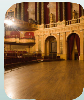
National Theatre Production Insights