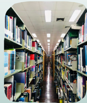
British Library behind the scenes