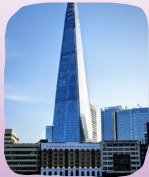
The Shard with Kraft Heinz

Behind-the-scenes tours that broaden aspirations and understanding of career opportunities.