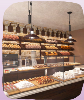
Greggs Warehouse Operations Tour